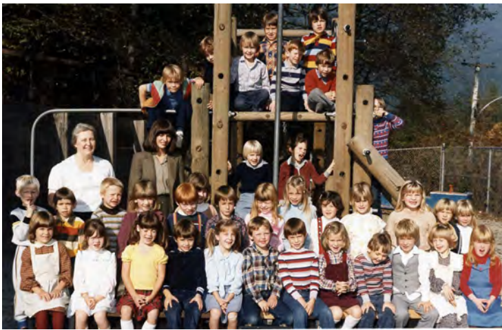
DCHS #3047 - Burrard View School kids in playground 1980-81