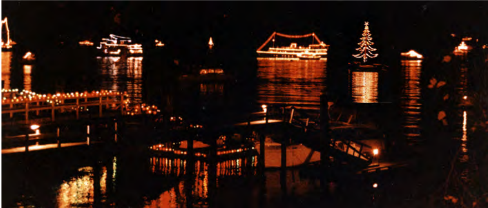
DCHS #4603 — Dec 2004 — The Carol Ship parade circling around Deep Cove delighting spectators on shore and on the cruise boats.