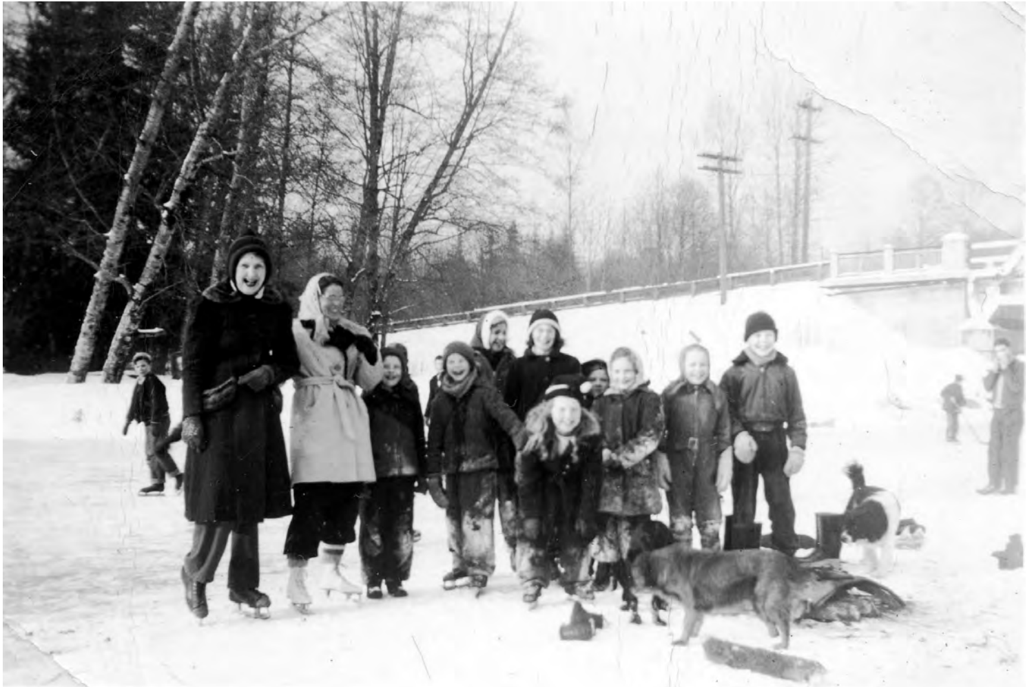
Happy group of skaters, Seymour River, 1947