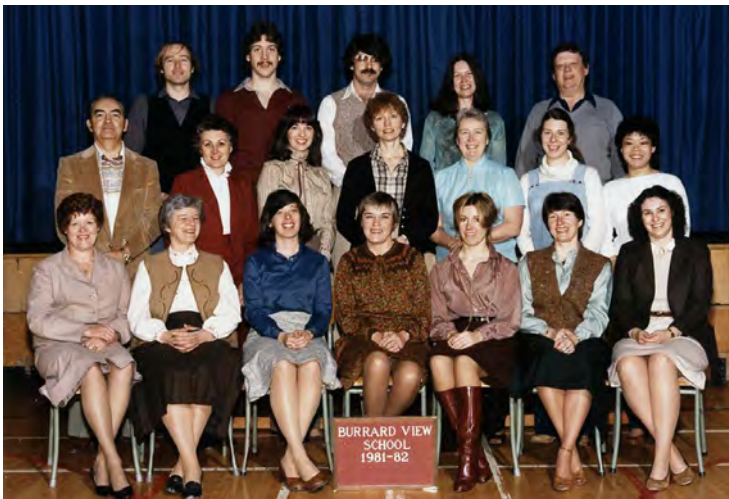
DCHS #3054 - Burrard View School Teachers 1981-82, courtesy Barb Philips