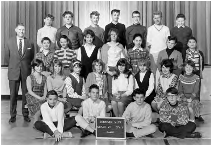
DCHS #5117 - Burrard View School class Gr 7 Div 1 1964-65