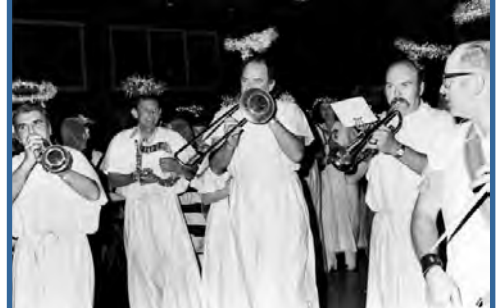
DCHS #2340 — Lions 'angel' band one — early 1970s, courtesy Mount Seymour Lions.