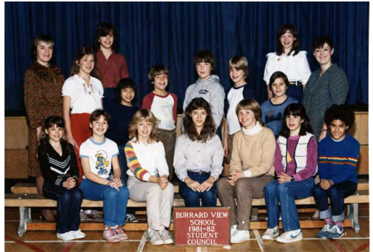
DCHS #1372 - Burrard View School- Student Council 1981-82